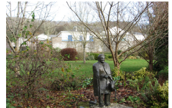
The statue of St Neot on the Doorstep Green

St. Neot is a lively community with a wide range of activities taking place in the village. The Village Hall, Doorstep Green and Playing Field are in constant use throughout the week providing venues for children’s activities. The school is adjacent to the new Village Green, incorporating an amphitheatre and gardens. In recognition of the exceptional environment in the village, St Neot won the National Village of the Year competition in 2004 and in 2006 was voted Village of the Decade.