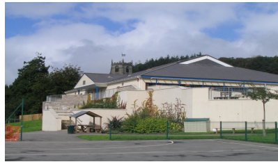
St Neot School and Church

The village of St. Neot gently nestles in the Glynn Valley, beautifully situated within the wide loop of the Loveny River on the southern side of Bodmin Moor. The village church stands in the centre of the village and is famous for its stained glass windows which date back to the fifteenth century.