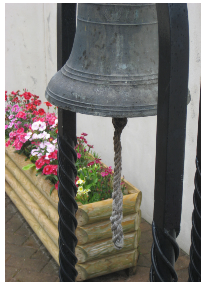
The old school bell

Ready! Before your child starts Steady! The Foundation Stage Go! Talking to parents