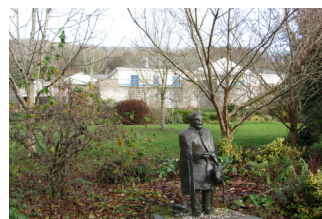
The statue of St Neot on the Doorstep Green

St. Neot is a lively community with a wide range of activities taking place in the village. The Village Hall, Doorstep Green and Playing Field are in constant use throughout the week providing venues for children’s activities. The school is adjacent to the Village Green, incorporating an amphitheatre and gardens. In recognition of the exceptional environment in the village, St Neot won the National Village of the Year competition in 2004 and in 2006 was voted Village of the Decade.