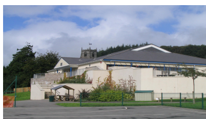
St Neot School and Church