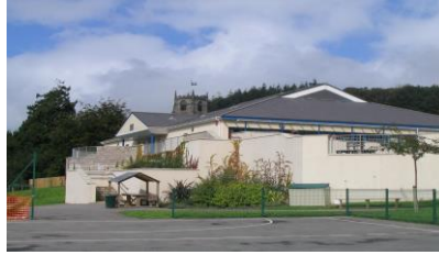
St Neot School and Church