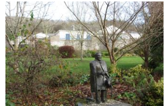
The statue of St Neot on the Doorstep Green

St. Neot is a lively community with a wide range of activities taking place in the village. The Village Hall, Doorstep Green and Playing Field are in constant use throughout the week providing venues for children’s activities. The school is adjacent to the Village Green, incorporating an amphitheatre and gardens. In recognition of the exceptional environment in the village, St Neot won the National Village of the Year competition in 2004 and in 2006 was voted Village of the Decade.