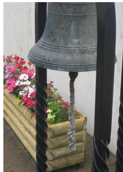
The old school bell

Ready! Before your child starts Steady! The Foundation Stage Go! Talking to parents