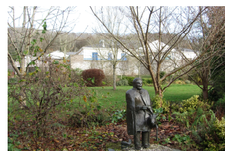
The statue of St Neot on the Doorstep Green

St. Neot is a lively community with a wide range of activities taking place in the village. The Village Hall, Doorstep Green and Playing Field are in constant use throughout the week providing venues for children’s activities. The school is adjacent to the Village Green, incorporating an amphitheatre and gardens. In recognition of the exceptional environment in the village, St Neot won the National Village of the Year competition in 2004 and in 2006 was voted Village of the Decade.