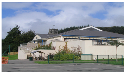
St Neot School and Church