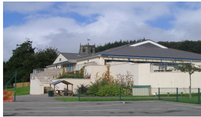
St Neot School and Church