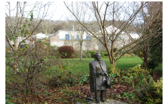
The statue of St Neot on the Doorstep Green

St. Neot is a lively community with a wide range of activities taking place in the village. The Village Hall, Doorstep Green and Playing Field are in constant use throughout the week providing venues for children’s activities. The school is adjacent to the Village Green, incorporating an amphitheatre and gardens. In recognition of the exceptional environment in the village, St Neot won the National Village of the Year competition in 2004 and in 2006 was voted Village of the Decade.